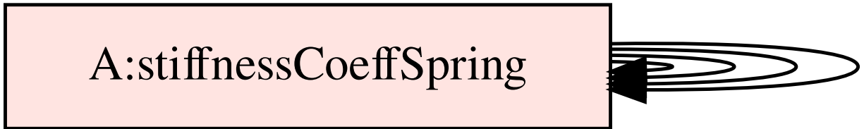
Figure 3: TraceGraphAvsA

The purpose of the traceability graphs is also to provide easy references on what has to be additionally modified if a certain component is changed. The arrows in the graphs represent dependencies. The component at the tail of an arrow is depended on by the component at the head of that arrow. Therefore, if a component is changed, the components that it points to should also be changed. Fig:TraceGraphAvsA shows the dependencies of assumptions on each other. Fig:TraceGraphAvsAll shows the dependencies of data definitions, theoretical models, general definitions, instance models, requirements, likely changes, and unlikely changes on the assumptions. Fig:TraceGraphRefvsRef shows the dependencies of data definitions, theoretical models, general definitions, and instance models on each other. Fig:TraceGraphAllvsR shows the dependencies of requirements and goal statements on the data definitions, theoretical models, general definitions, and instance models. Fig:TraceGraphAllvsAll shows the dependencies of dependencies of assumptions, models, definitions, requirements, goals, and changes with each other.